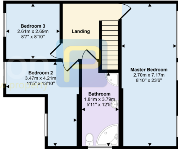
First Floor Approx 54 sq m / 583 sq ft

This floorplan is only for illustrative purposes and is not to scale. Measurements of rooms, doors, windows, and any items are approximate and no responsibility is taken for any error, omission or mis-statement. Icons of items such as bathroom suites are representations only and may not look like the real items. Made with Made Snappy 360.