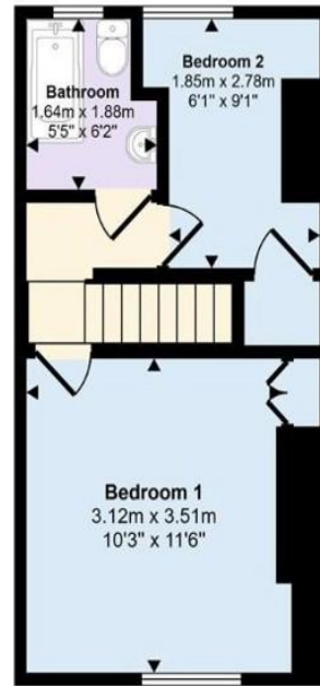
Second Floor Approx 26 sq m / 282 sq ft

This floorplan is only for illustrative purposes and is not to scale. Measurements of rooms, doors, windows, and any items are approximate and no responsibility is taken for any error, omission or mis-statement. Icons of items such as bathroom suites are representations only and may not look like the real items. Made with Made Snappy 360.