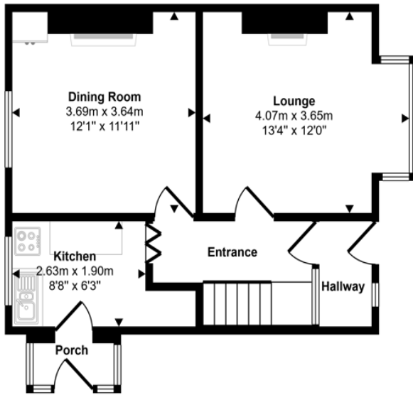
Ground Floor Approx 44 sq m / 476 sq ft

Approx Gross Internal Area 86 sq m / 926 sq ft