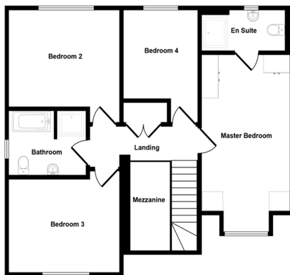
First Floor Approx 75 sq m / 812 sq ft

This floorplan is only for illustrative purposes and is not to scale. Measurements of rooms, doors, windows, and any items are approximate and no responsibility is taken for any error, omission or mis-statement. Icons of items such as bathroom suites are representations only and may not look like the real items. Made with Made Snappy 360.