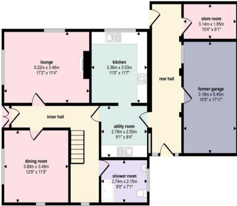
Ground Floor Approx 112 sq m / 1202 sq ft

Approx Gross Internal Area 185 sq m / 1995 sq ft